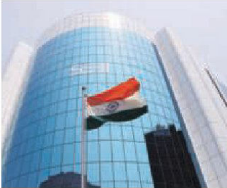
Sebi headquarters in Mumbai

Currently, Sebi has two office premises in BKC, including its headquarters. Additionally, it has one office at Nariman Point in the