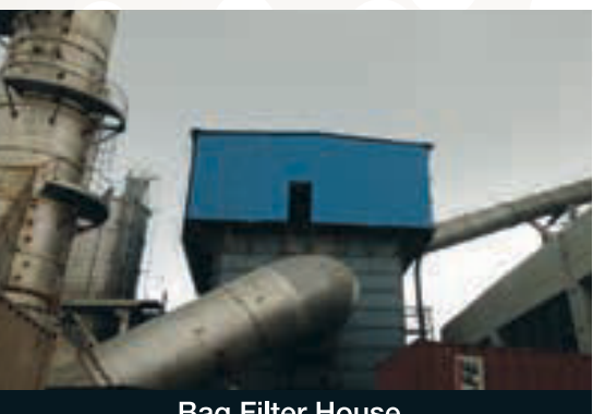
Bag Filter House