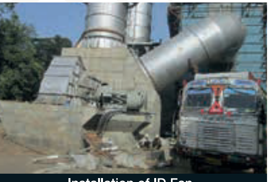
Installation of ID Fan